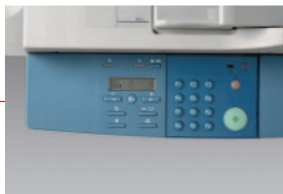
Clear control panel for ease of use