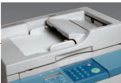
Productive Automatic Document Feeder

Busy offices faced with larger document workloads will find the optional Automatic Document Feeder (ADF) offers the easiest way to increase efficiency. It allows the machine to scan and copy all your multi-page documents automatically, leaving you free to get on with more important work.