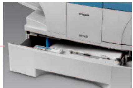
High capacity 500-sheet paper cassette